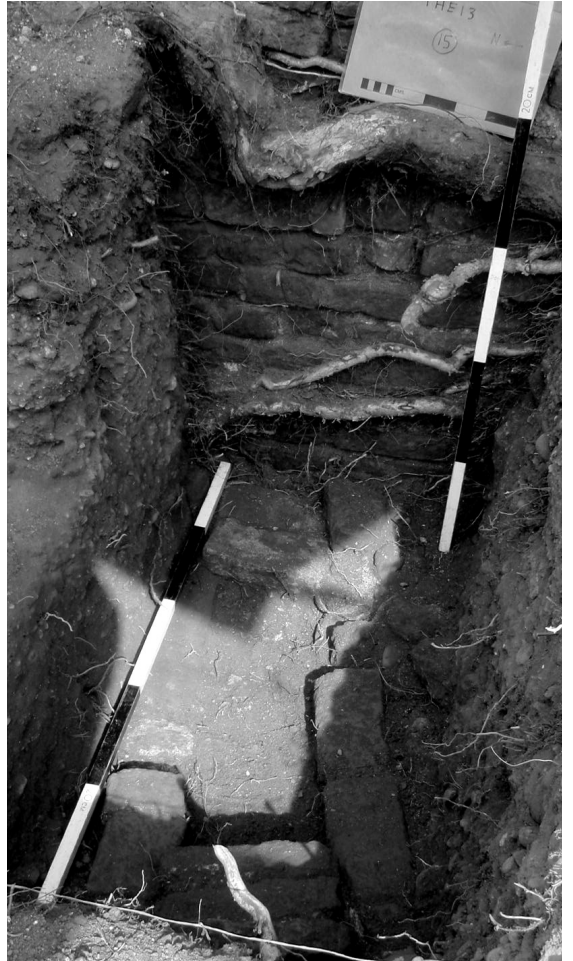
Fig. 3: The Drain (Foreground) with Blocking Brick Across its Line and Cut Through by the Privy Garden Boundary Wall

This wall is known to have been here by 1611, even if a door in it had subsequently been blocked (Fig. 1 SWA 7), so the water supply channels probably belong to the Tudor water gardens of